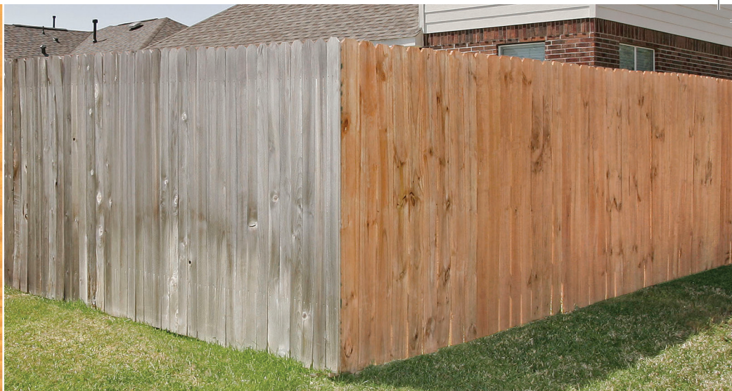
Above is a photo of an actual fence installation in Tomball, TX. The fencing on the left is cedar. On the right is ProWood Micro with MicroShades. The two were put up within 30 days of one another, 15 months before the photograph was taken.