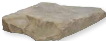
m. LARGE SKIMMER #166601 38" x 31" x 5" 14 lbs