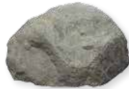
c. MEDIUM STANDARD #158232 18" x 23" x 13" 7.5 lbs