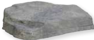
k. SMALL SKIMMER #166599 21" x 18" x 3.5" 4.5 lbs