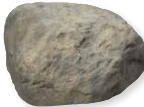
h. LARGE BOULDER #158233 47" x 41" x 22" 27 lbs