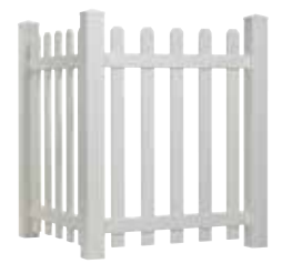
e. DOG EAR SPACED 3" PICKET #175843 42.75" L x 42.75" W x 48" H