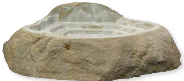
b. LARGE BIRD BATH

#170284 33" x 23" x 13" Pool ranges from 1.5" to 2.5" deep