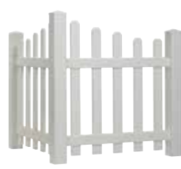
g. DOG EAR SCALLOPED SPACED 3" PICKET #175845 42.375" L x 42.375" W x 48" H