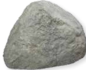
e. JUMBO STANDARD #166654 28" x 19" x 20" 13 lbs