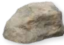
b. SMALL STANDARD #158231 17" x 10.5" x 8" 4 lbs