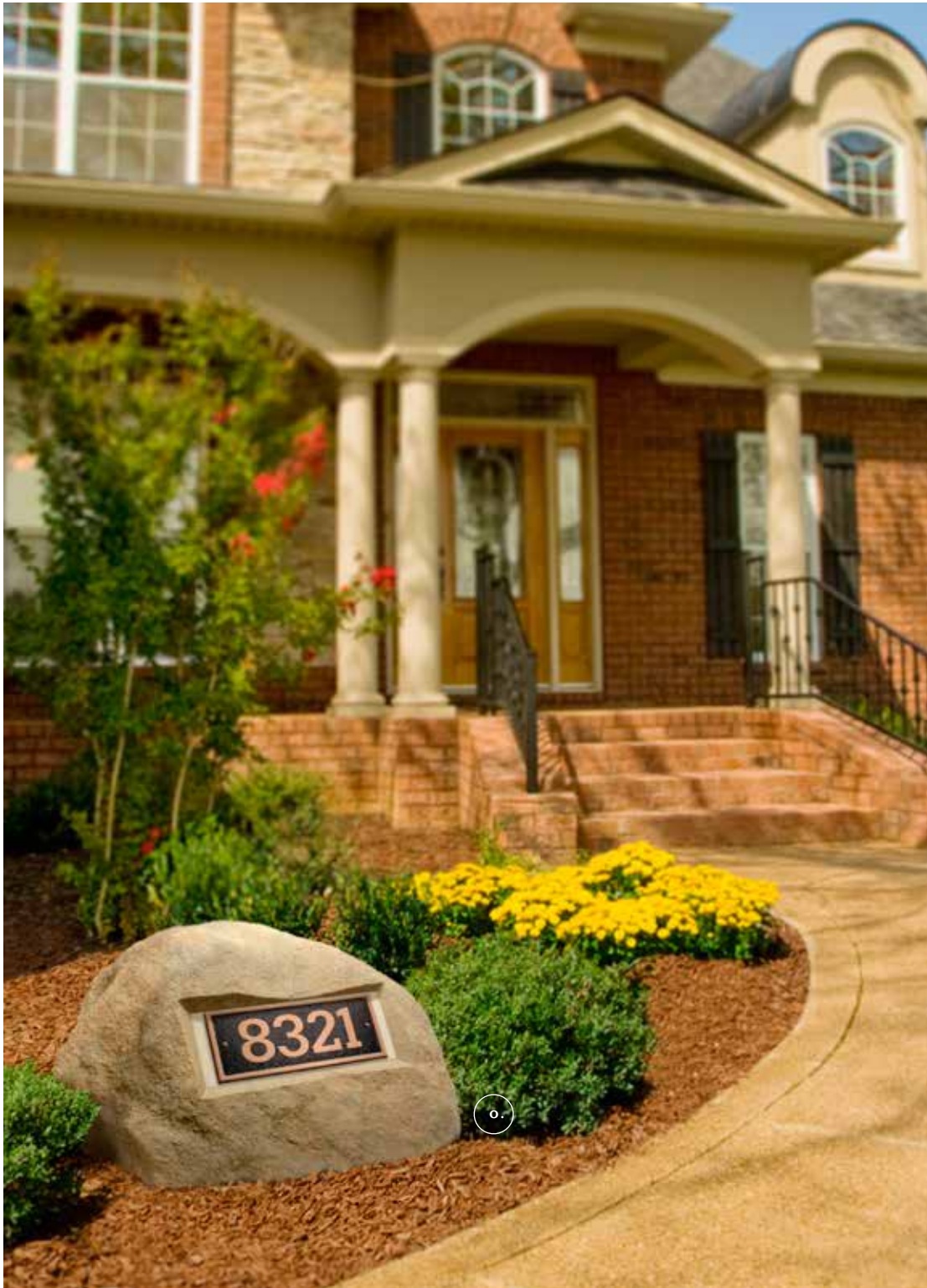
Product details on page 5