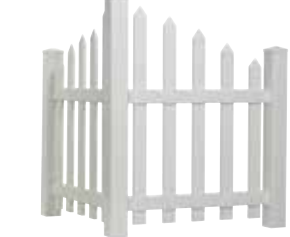
f. SPADE SCALLOPED SPACED 3" PICKET #175844 42.375" L x 42.375" W x 48" H