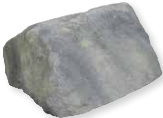
g. LONG STANDARD #167219 31.5" x 23.5" x 12.5" 9.6 lbs