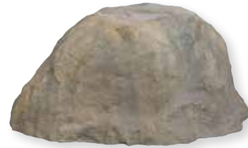
i. SITTING BOULDER #167221 52.5" x 35.5" x 25" 28 lbs