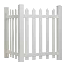
d. SPADE SPACED 3" PICKET #175842 42.75" L x 42.75" W x 48" H