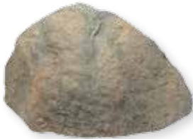
d. LARGE STANDARD #166655 27" x 21" x 14" 8.5 lbs