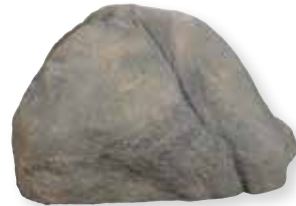
f. EXTRA LARGE STANDARD #167218 31" x 27.5" x 16.5" 11.5 lbs