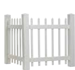
b. SPADE SPACED 1.5" PICKET #175840 40" L x 40" W x 36" H