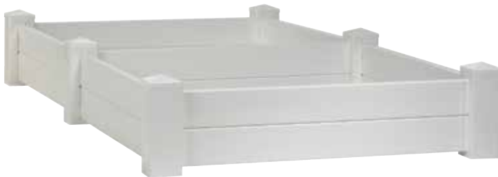
b. 4x4 RAISED GARDEN BED ADD-ON KIT #175037 Add-on kit to 175036 to make dimensions of 8' L x 4' W x 12" H