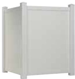
a. PRIVACY #175848 45.25" L x 45.25" W x 48" H