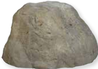
j. GIANT BOULDER #167220 54.5" x 40" x 31" 42 lbs