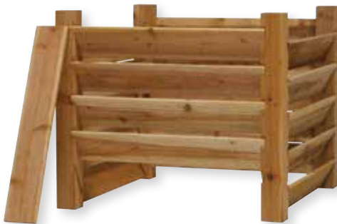
c. 32" x 32" x 32" CEDAR LOUVERED COMPOST BIN #153189 18 cubic feet of composting space