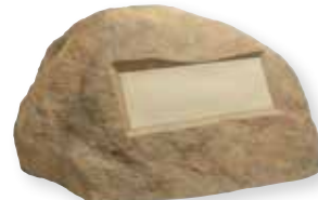
o. ADDRESS ROCK #194876 31" x 27" x 16.5" 11.5 lbs