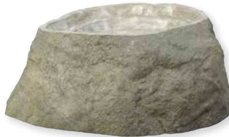
a. MEDIUM BIRD BATH

#170284 33" x 23" x 13" Pool ranges from 1.5" to 2.5" deep