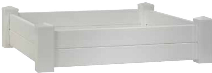
a. 4x4 VINYL RAISED GARDEN BED #175036 4' L x 4' W x 12" H