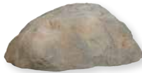
n. GROUND COVER #166602 47" x 44" x 13.5" 22.5 lbs