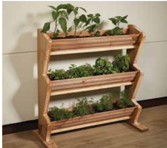
b. VERTICAL GARDEN PLANTER #166231 35" x 15.75" x 36" 6" planting depth