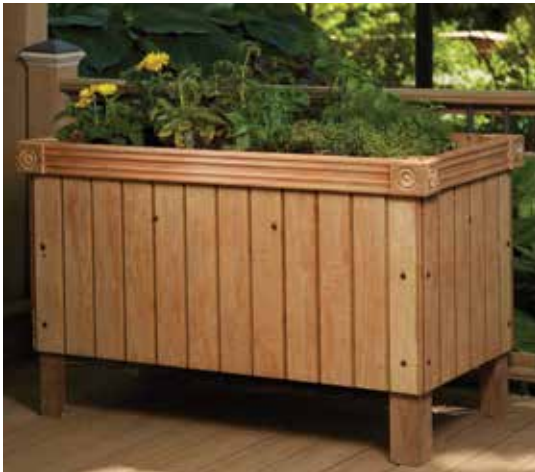
a. 2x4 ELEVATED GARDEN PLANTER #166228 48" x 24" x 31.5" 6" planting depth