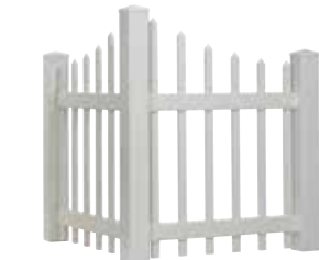
c. SPADE SCALLOPED SPACED 1.5" PICKET #175841 38.25" L x 38.25" W x 48" H