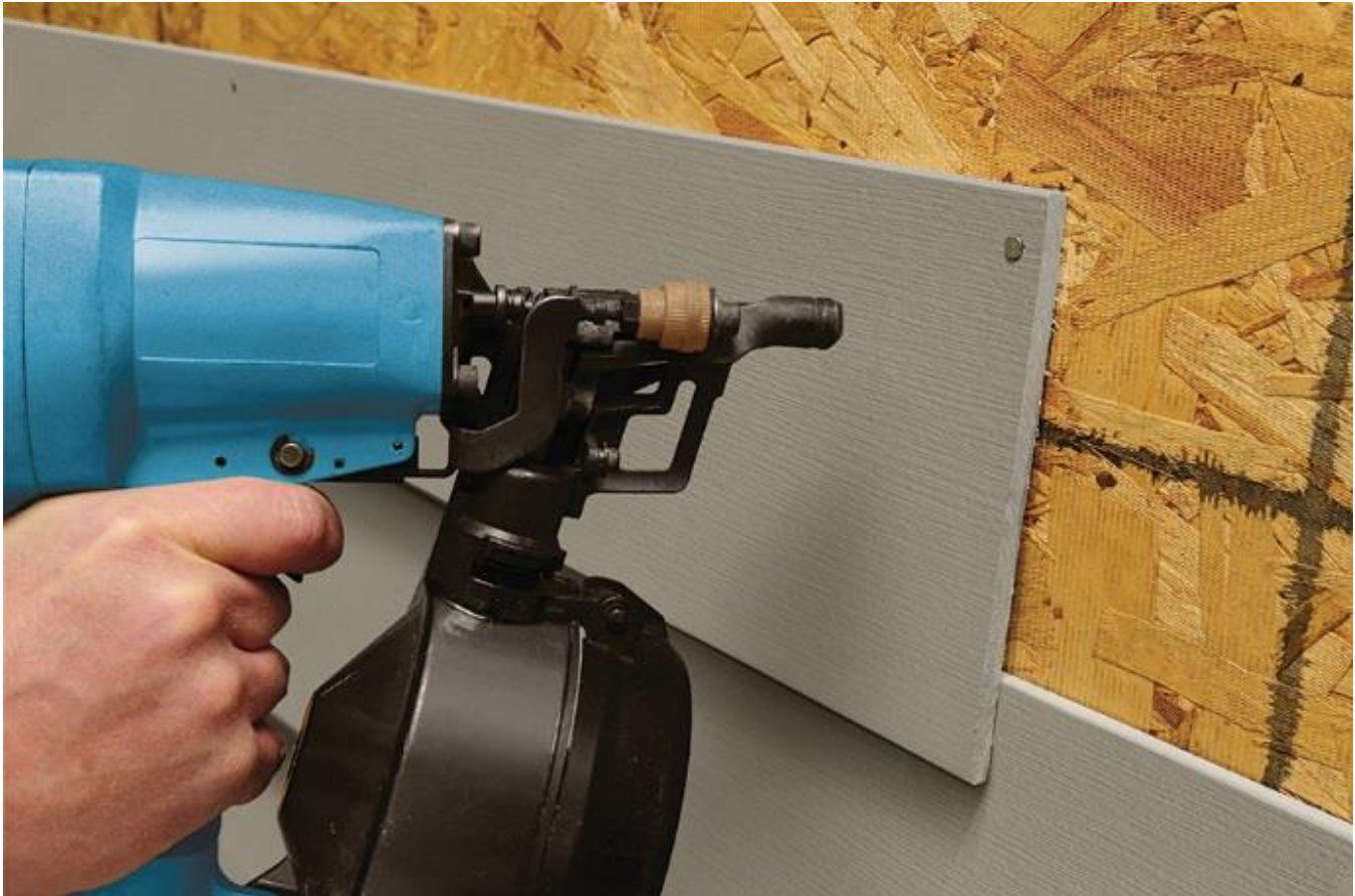
Figure 2: Eotek Siding Installation

This listing report is intended to indicate that NTA, Inc. has evaluated the product described and found it to be eligible for labeling. Product not labeled as specified herein is not covered by this report. NTA, Inc. makes no warranty, either expressed or implied, regarding the product covered by this report.